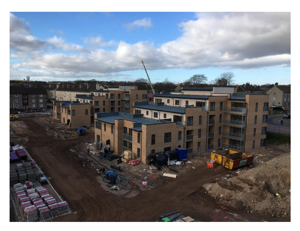
Blocks 1 & 2 – April 2022