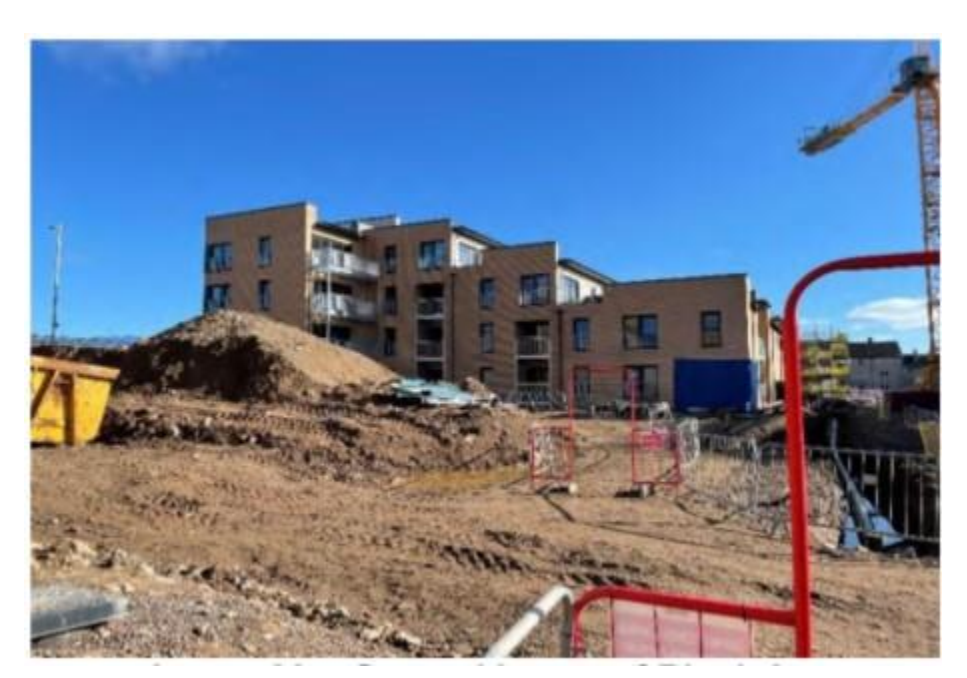
Block 3 – March 2022