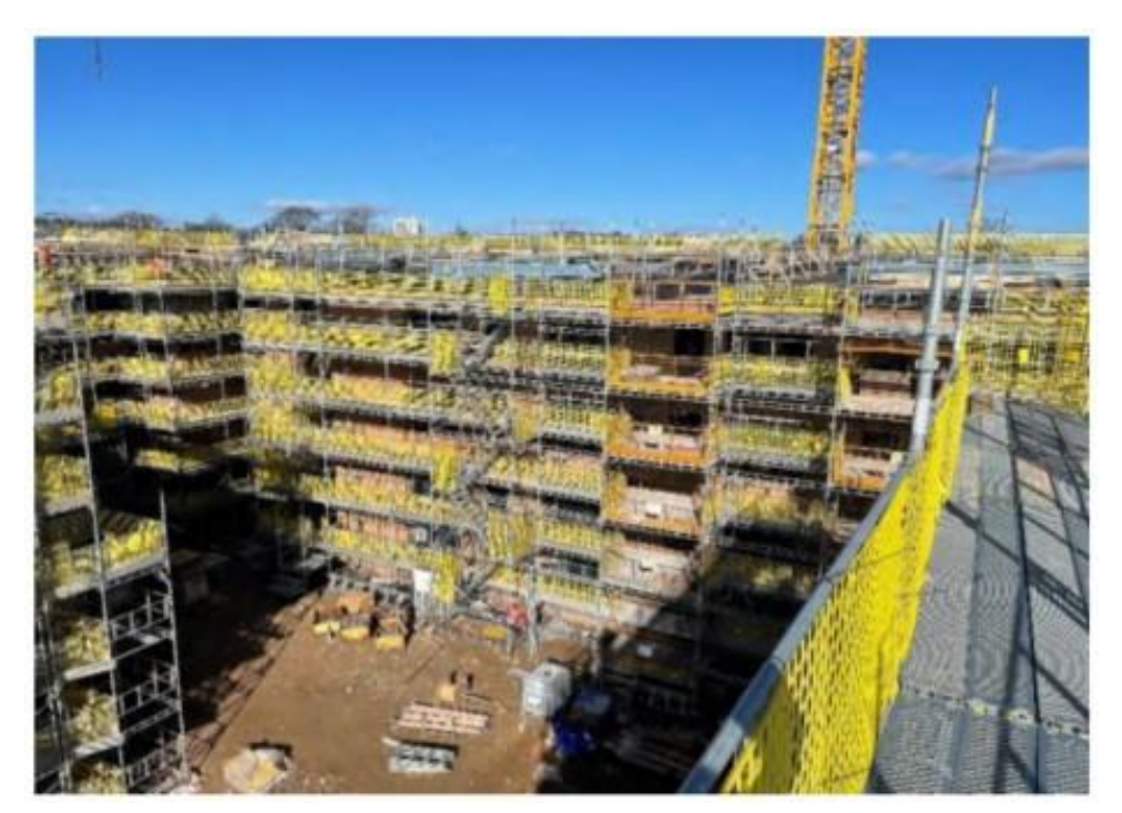
Block 6 - March 2022