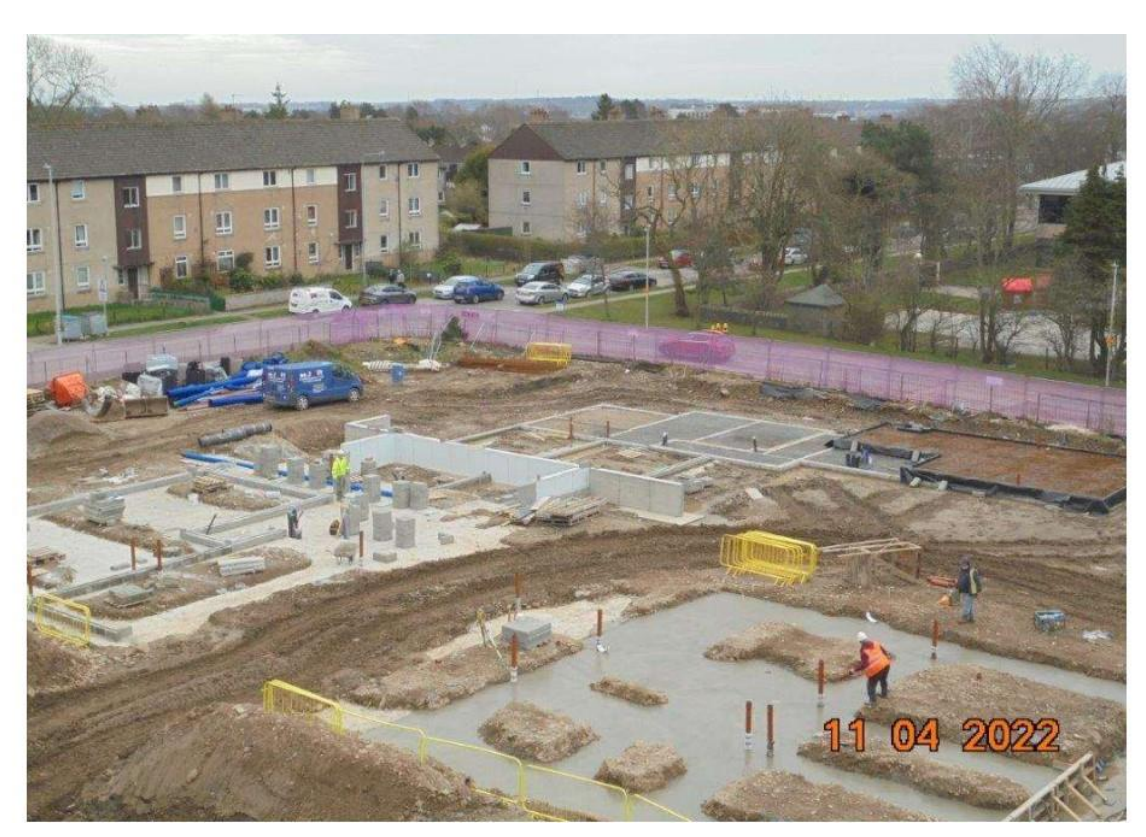
Block 8 – April 2022